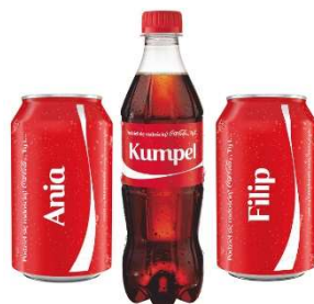
Photo 3. Coca-Cola cans and a bottle with names

Source: https://www.wirtualnemedi.pl/artykul/podziel-sie-radoscia-polskie-imiona-i-ksywki-na-opakowaniach-coca-coli-wideo (Accessed: 16 May 2023).