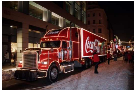
Photo 2. Coca-Cola Xmas truck

Source: https://www.biznesistyl.pl/lifestyle/po-godzinach/21113_.html (Accessed: 16 May 2023).