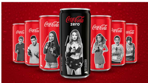
Photo 4. Coca-Cola cans with images of Polish influencers .

Source: https://marketingprzykawie.pl/espresso/gwiazdy-internetu-na-puszkach-coca-coli-wideo/gwiazdy-internetu-na-puszkach-coca-coli-wideo-2/ (Accessed: 16 May 2023).